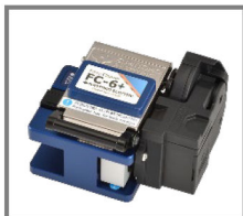
Bench-top cleaver FC-6+ series