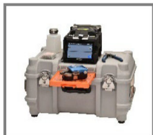
Carrying case with worktable CC-72