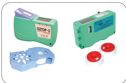
Cletops and Replacement Cartridges