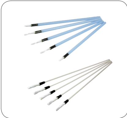
Cletop (ACT) Adapter Cleaning Sticks