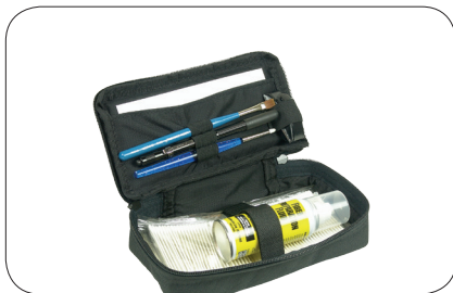
Splicer V-Groove Cleaning Kit