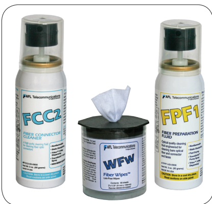
Connector Cleaning Fluids and Wipes