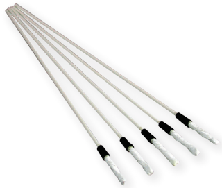
Type 2.5 mm