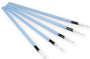
Type 1.25 mm